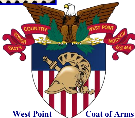
West Point Coat of Arms

We finish the day at Valley Forge, PA. RON: Holiday Inn Express in King of Prussia. (Meals: Breakfast (B) & (L); (D) on own)